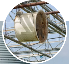
Turbulator Recirculation Fan